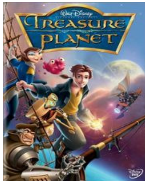
September 26: "Treasure Planet"