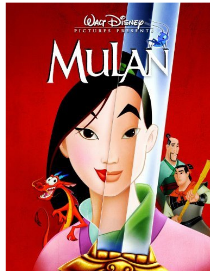
September 12 "Mulan"