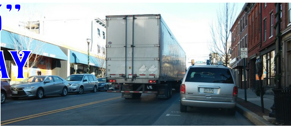
It'll take a while for truckers to understand the new “bypass.”