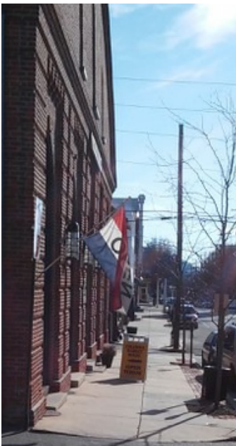
Not very inviting for pedestrians | navigating middle of the sidewalk signs - Especially tough for persons with a disability.