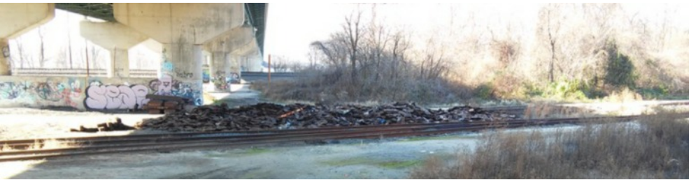
Above: On the trail, Powerball entices, junk metal piles and graffiti offend.