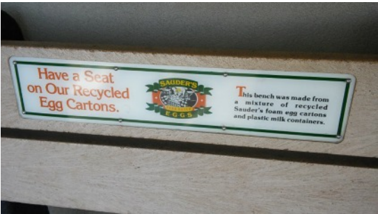
Left: signs along Route 462 at Musser’s Shopping Center. Top: Bench made of recycled egg cartons. Below: This is the New STOP HERE ON RED sign that Motorists now see as they depart River Park.