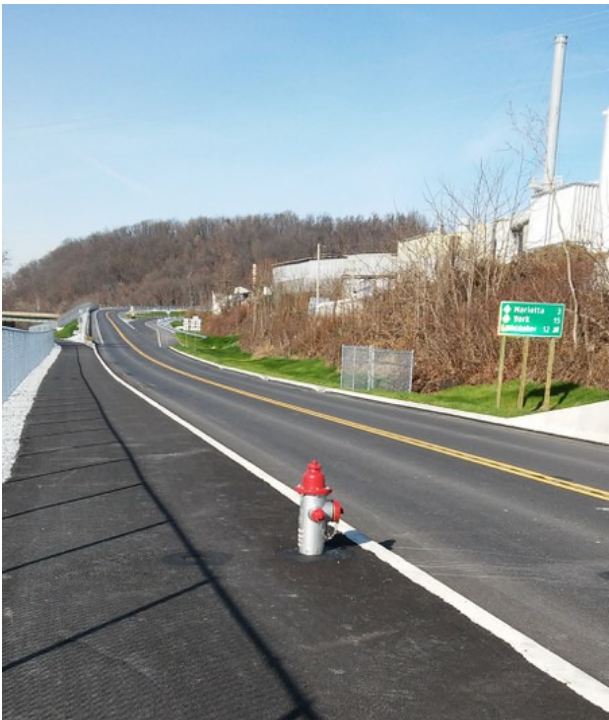
Trail walkers: keep alert as the roadway meets the walking trail. Watch out, too, for the unguarded hydrant.