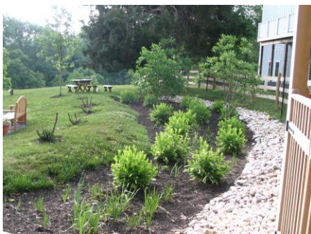
Trimmed rain garden at H.C. Conservancy