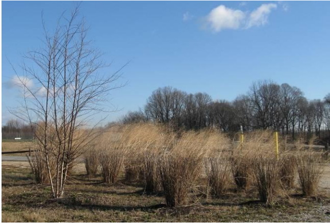
Grasses can be left untrimmed until spring.