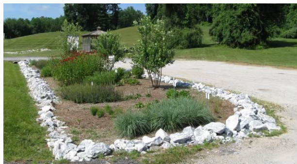
Demonstration rain garden at Alpha Ridge landfill