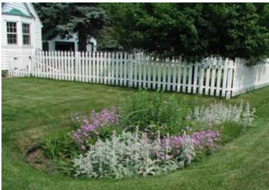
A rain garden with no berm