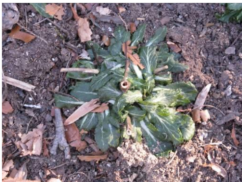
A basal rosette