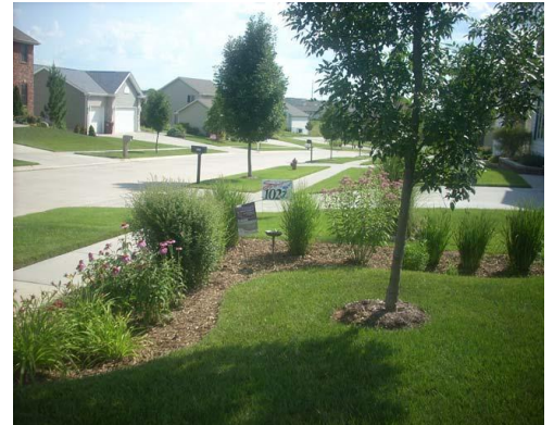
A weeded rain garden