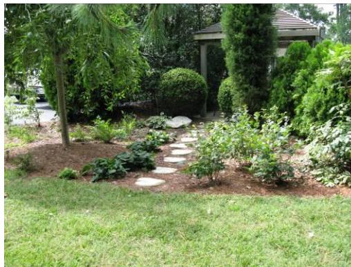
A rain garden with a path